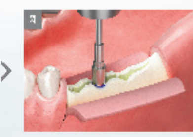
Expansion drill to expand ridge.