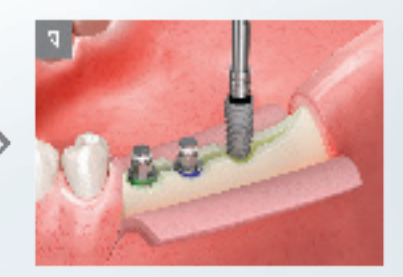
Fixture placement into expanded ridge.