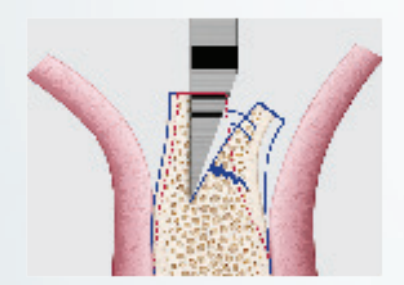
Ridge Split Kit