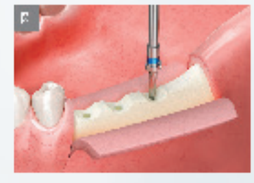
Initial Drilling to define fixture positioning.